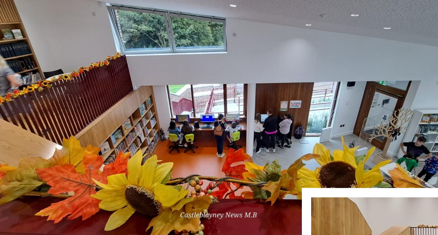
Castleblayney News M.B