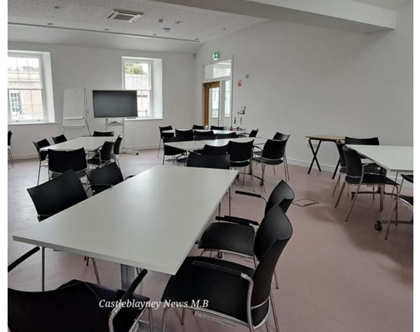
Castleblayney News